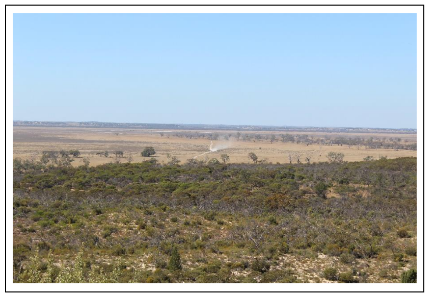
O'Sullivans Lookout over Werrengan Plains

And a view it was, looking out over Werrengan Plains. Low level shrub with green and gold foliage, sand dunes and dusty tracks were visible as fa as the eye could see.