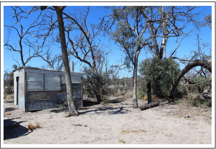
Rabbit Hut (1988)

Our last stop for the day was Snowdrift. It was a large sand dune that was being used like a snow hill. With make shift sleighs with old tyres, plastic bags and Frisbee, anything the kids could get hold of to have some fun to slide down the sand dune.